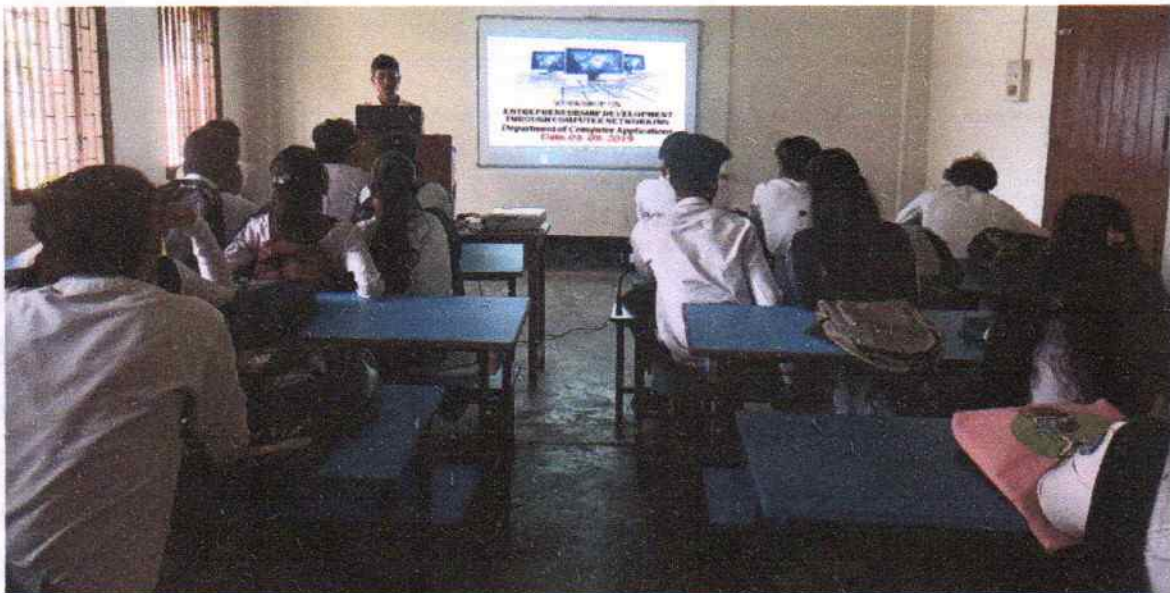
Photographs of the Workshop