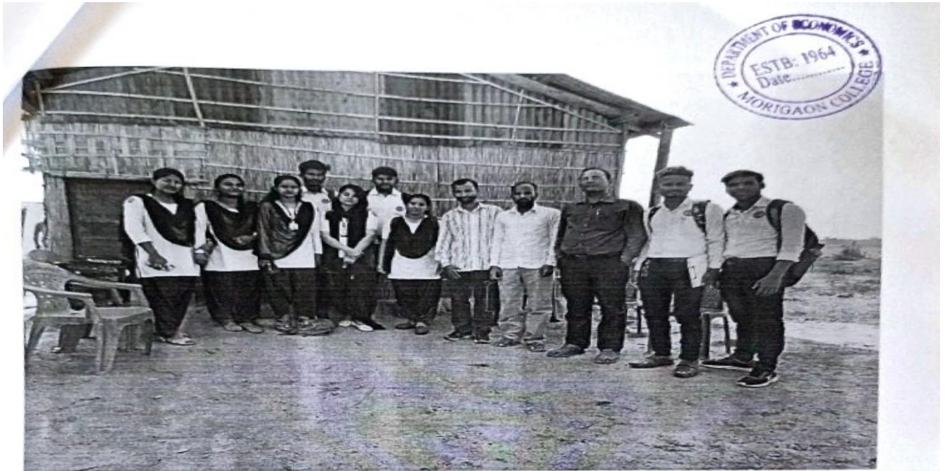
Survey on Rural Poverty in Char Area of Bhuragaon, Morigaon by Department of Economics, Morigaon College on 24.12.2019