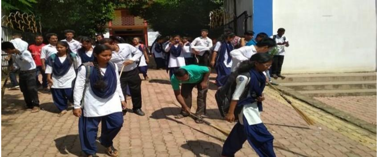
150 th Gandhi Jayanti Cleanliness Programme at College campus. Date-2 October, 2019