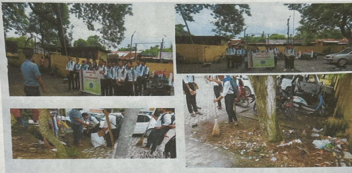
Some Snapshots of the Programme